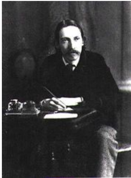
Robert Louis (Balfour) Stevenson November 13, 1850 – December 3, 1894